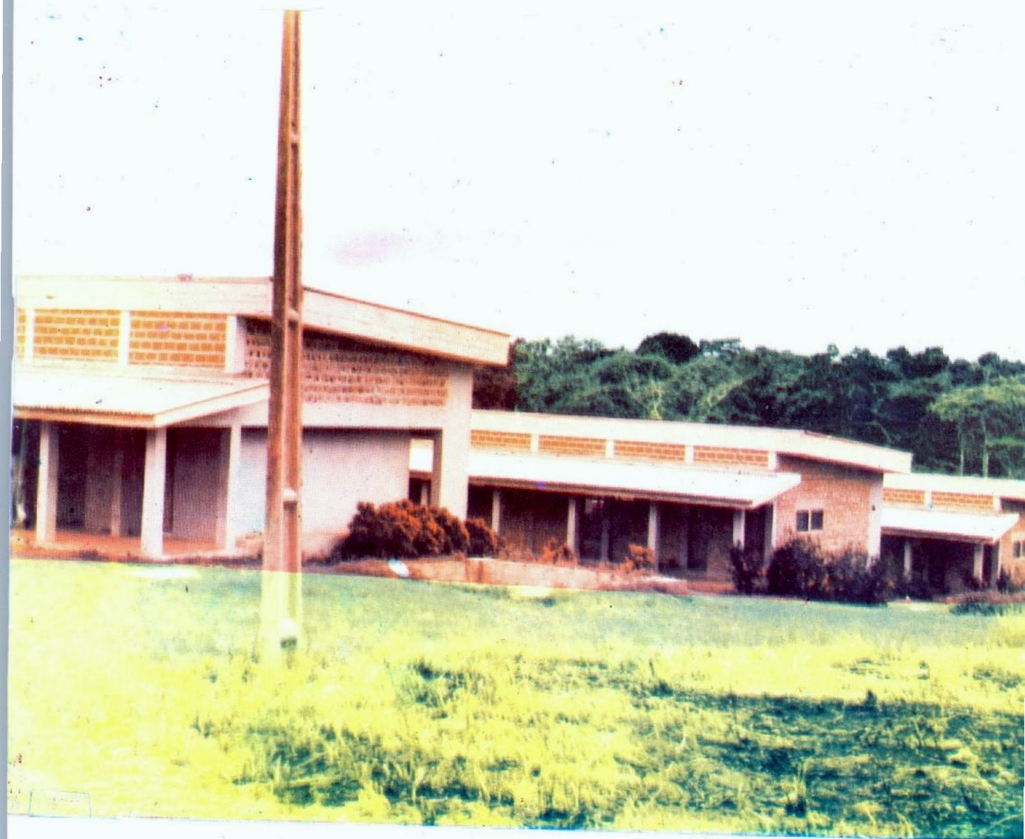
NBRRI RESEARCH COMPLEX BUILT WITH ALTERNATIVE BUILDING MATERIALS DEVELOPED BY THE INSTITUTE.