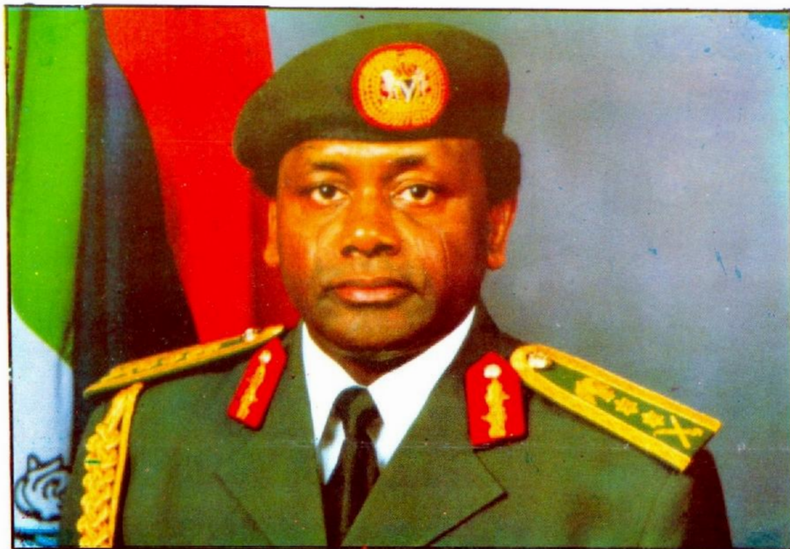
GEN. SANI ABACHA, GCON Head of State & Commander-in-Chief of the Armed Forces of Nigeria.